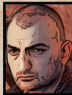
ELEAZAR (THE BRAVE)