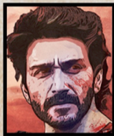
JUDAH (THE HAMMER)