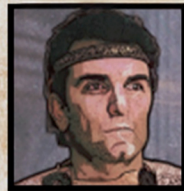
ANTIOCUS (THE KING)